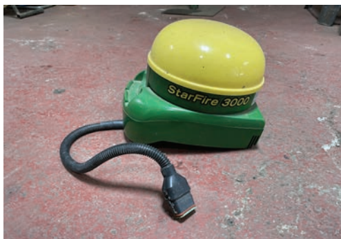
John Deere StarFire 3000 receiver, s. no PCGT3TB755544.