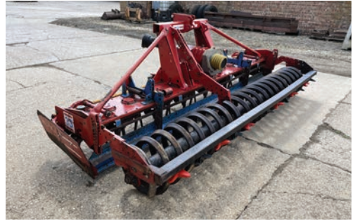
Lely Roterra 350 – 33 power harrow, 3.5m, rear coil press, rear levelling board.