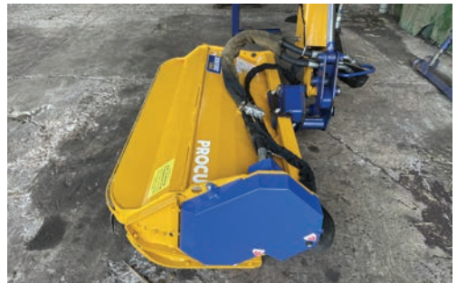
2007 Bomford Falcon 6T Parallel hedge cutter, telescopic arm, hydraulic lever controls, 3-point linkage frame mount, 2018 Bomford Turner Pro-Cut 1.6m flail cut head, hydraulic rear roller, LED lights, s. no B181835.