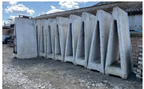
9 x Poundfield concrete A frame panels, 8' x 4'.