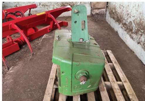
John Deere weight block, 900kg, 3-point linkage bracket kit.

McConnel All-Work saw bench, PTO driven, s. no 15AW65.