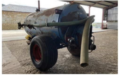
Tanco 1400 tanker, PTO pump, 4" and 6" outlets and hoses, 1.5" washdown hose, single axle, Goodyear tyres 550/60R22.5, s. no 1202.

Trailer mounted diesel bowser, single skin plastic tank, 12v battery pump, car tow hitch, fire damaged.