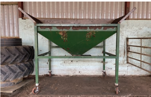
Fraser hopper, 2 tonne, transport wheels, grain chute, greedy boards.