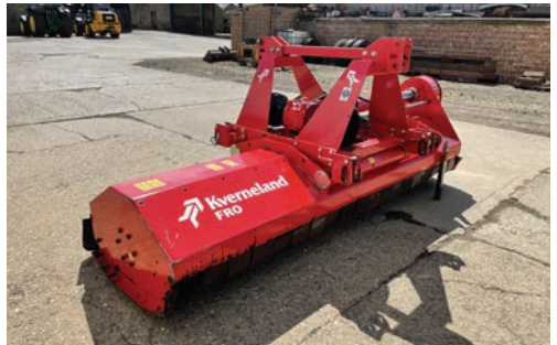
2011 Kverneland Macho FRO flail topper, 2.8m, front or rear mount, hydraulic side shift, roller, rubber skirt, s. no MACHOXX10117.