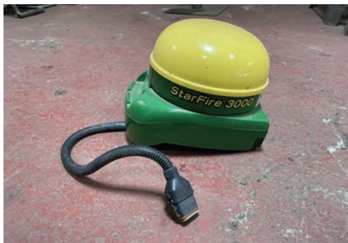
John Deere StarFire 3000 receiver, s. no PCGT3TB755544.