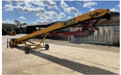
Fyson grain and potato elevator, approx. 10m, three phase electric, 415V motor, hydraulic control, hydraulic controlled swinging extension, transport wheels, tow hitch.