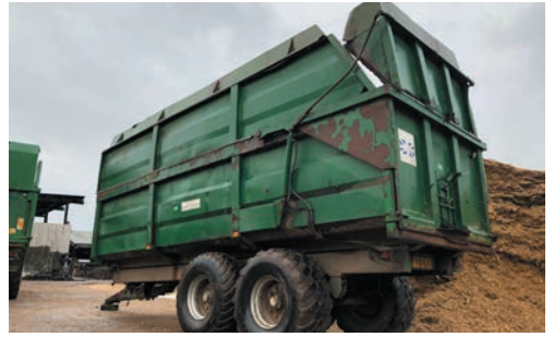
2003 Richard Western grain trailer, 16 tonne, tandem axle, c/w silage sides, hydraulic tipping, hydraulic rear door, sprung axles, sprung drawbar, hydraulic brakes, grain chute, flotation tyres, s. no 12289.