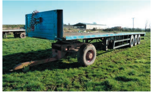
2 x Converted flatbed lorry trailer, 45ft (approx.), tri-axle, timber floor, air brakes, c/w dolly.

Converted flatbed lorry trailer, 34ft (approx.), tandem axle, steel floor, c/w dolly.