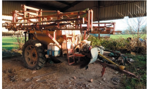
1984 Vicon LS2300 trailed sprayer, 24 metre boom, 2,300 litre tank, rise and fall, mixer tank, hand wash tank, out of test, Goodyear row crop tyres 13.6R36, s. no 84.1079.

Allman sprayer, 12 metre boom, 3-point linkage mounted.