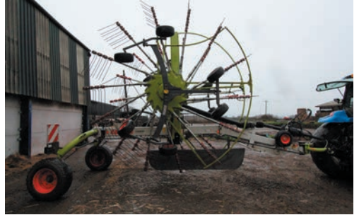
2015 Claas 2900 Liner rake, twin rotor, vari-width, hydraulic width adjustment, hydraulic folding, rear steer axle, s.no 98803832.