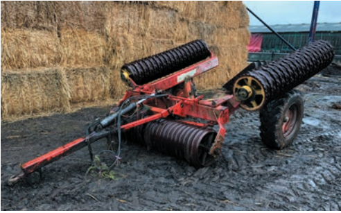
Vaderstad Rollex 620 Cambridge rolls, 6.2 metre (approx.), hydraulic folding, s. no 3962.