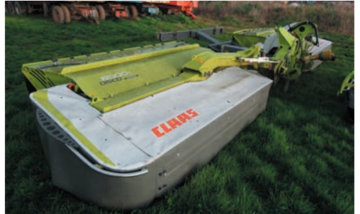
2015 Claas 8500 C Disco Contour mowers, model year 2016, conditioner, hydraulic folding, s.no F6301056.