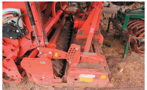
2012 Maschio Combi Orso 3000 power harrow, 3 metre working width, rear packer, s. no 1298R0279.