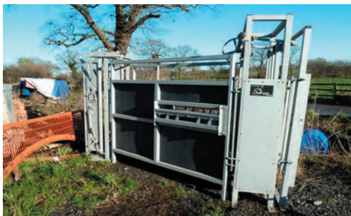
Bateman cattle crush, yoke and gates.