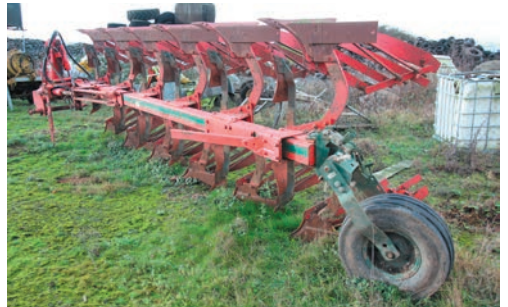
2010 Vogel & Noot Plus XS950 BA70 plough, six furrow, reversible, variable width, slatted boards, depth wheel, s. no 77388.