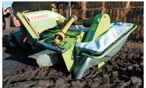
2015 Claas 3200 FC Disco Profil front mower, model year 2016, 3 metre working width, s.no F7302325.