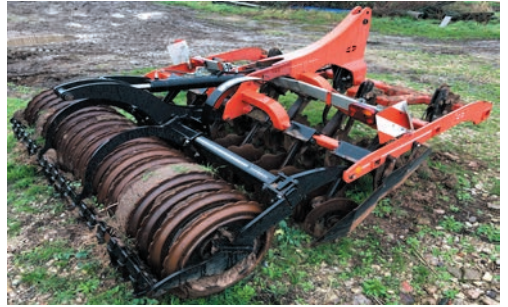
2013 Grégoire Besson Combi Mix one pass cultivator, five legs, two rows of discs, hydraulic depth controlled rear roller, 2.9 metre working width, 3 metre transport width, s. no N128991.