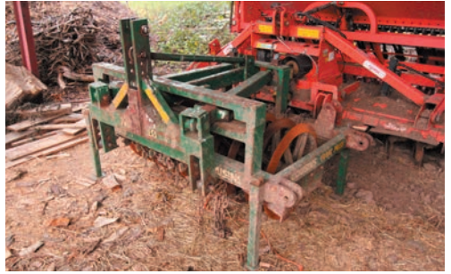
Cousins Front Press , 4 metre, folding, stand, s. no FP28FM4515.

Mole plough, single leg, 3-point linkage mounted.