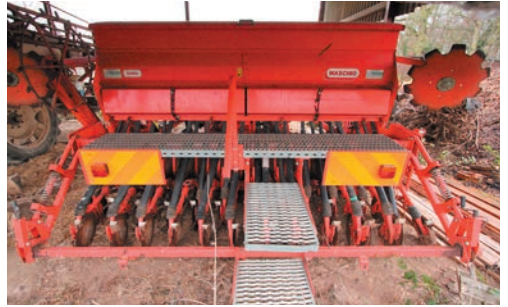
2012 Maschio DAMA 300 24DS DMRPK5 seed drill, 3 metre, disc coulters, trailing harrows, stand, s. no 129260247.