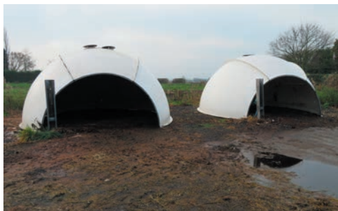
4 x Holm & Laue Igloo , calf huts, fibreglass.

2 x Volac Urban U40 Feeder , automatic, electric, stainless steel cabinet, c/w crate.