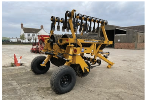
2018 McConnell Consolidator 6400-61 Cambridge rolls, 6.4m, hydraulic levelling boards, hydraulic folding, 21" rings, transport lights, s. no MI855216.