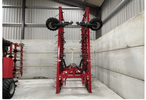
2019 Weaving Stubble Rake , 8m, 3-point linkage mounted, hydraulic folding, hydraulic tine adjustment, land wheels, s. no WMO2634.