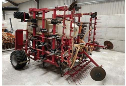
2014 Weaving Sabre Tine drill, 4.8m, 3-point linkage mounted, hydraulic folding, trailing tine harrows, disc tramline markers, LED lights, Stocks Ag Turbo Jet applicator, s. no 11018862.