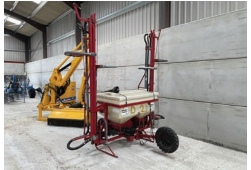
Horstine Farmery Microband avadex applicator, 12m, 3-point linkage mounted, land wheel drive.