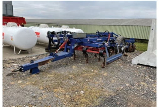
Simba X-Press XP/4.6/FW , 4.6m, hydraulic folding, double D press, trailed, s. no 133240117.