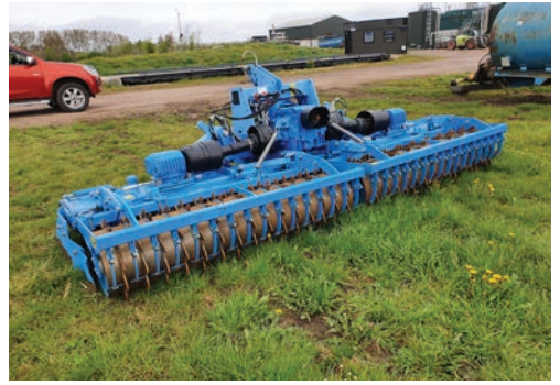
2017 Lemken Zirkon 12 power harrow, 4m, rear packer roller, hydraulic folding, s. no 441097.