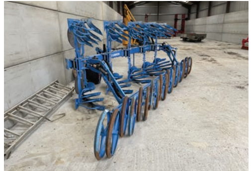
2018 Lemken Juwel 8 reversible plough, five furrow, slatted bodies, hydraulic vari-width, hydraulic land wheel, rear discs, skims, s. no 458627, c/w 2018 Lemken Flexpack JR5-100 press, s. no 458644.