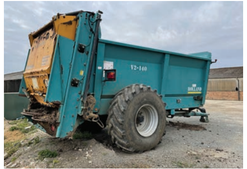
2008 Rolland V2-140 muck spreader, rear discharge, hydraulic rear slurry door, single axle, sprung drawbar, s. no 2122121