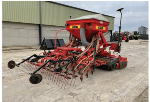
2009 KRM 300/25-R drill, 3m, 3-point linkage mounted, tine coulters, rear packer roller, trailing tine harrows, disc tramline markers, stand, s. no 48295, c/w 2009 KRM Magnum 300 power harrow, 3m, s. no 22894.