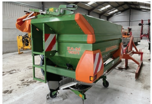
2015 Amazone ZA-M 1501 Profis fertiliser spreader, Soft Ballistic System, AmaTron, 24m discs, s500 greedy boards and folding hopper cover, stand and wheels, s. no ZAM0118957.