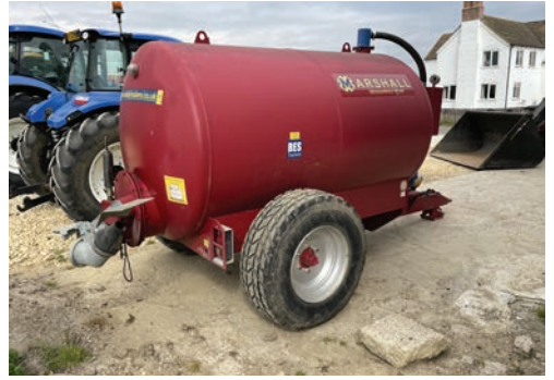
2016 Marshall ST1200 tanker, 1,220 gallons, PTO pump, hydraulic control, six stud single axle, rear splash plate, Agri-Master tyres 385/65R22.5, s. no A87188.