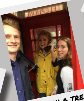
TAKING PART IN A TREASURE HUNT AROUND NEWARK