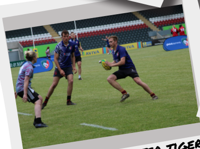
PLAYING IN LEICESTER TIGERS' TOUCH RUGBY TOURNAMENT AT WELFORD ROAD