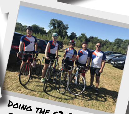
DOING THE C2C2C 100M BIKE RIDE FOR CHARITY