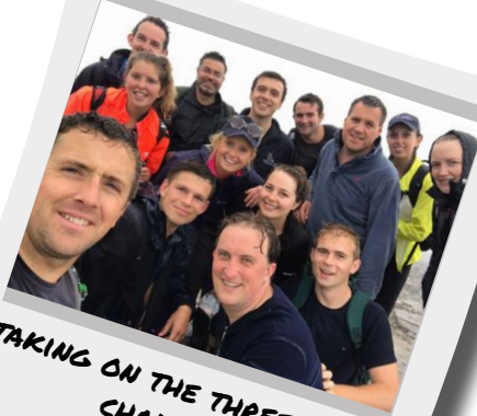
TAKING ON THE THREE PEAKS CHALLENGE

In addition, we hold firm-wide activities too, like our inter-office cricket and rugby tournaments.