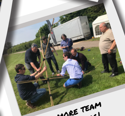
MORE TEAM BUILDING!