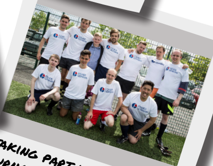
TAKING PART IN 'DAS FUTBOL TOURNOI' AT BURTON ALBION FC