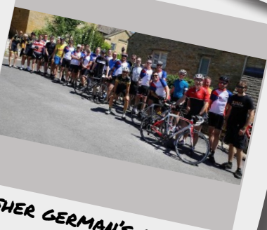
FISHER GERMAN'S CYCLE DAY, EVESHAM