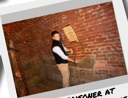
TAKEN PRISONER AT WARWICK CASTLE ON THE COMMERCIAL SECTOR DAY