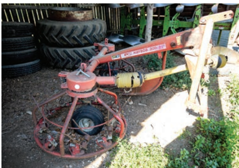
PZ Haybob 300.