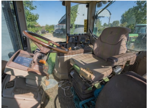
2003 John Deere 6820 , registration V003 DXZ, 12,534 hours, 4WD, three manual spools, 40km/h, pushout pick up hitch, air conditioning, passenger seat, anti-theft pin pad, on farm from new, BKT tyres 520/85R38 – 60%, Cultor tyres 420/85R28 – 60%. s. no L06820V358306.