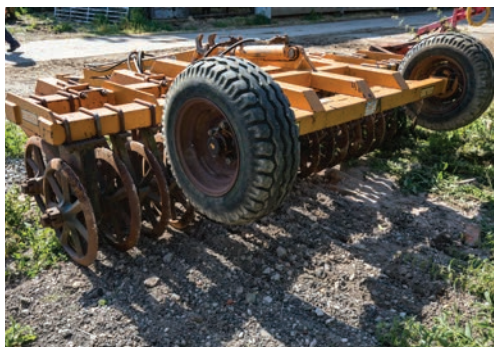
Simba double press, 3.5 metre, leading tines, trailed, hydraulic lift, s no. 40809072.