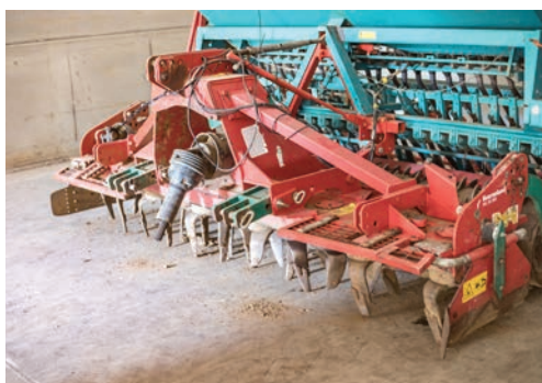
1999 Kverneland NG18300 power harrow, 3 metre, rear packer roller.