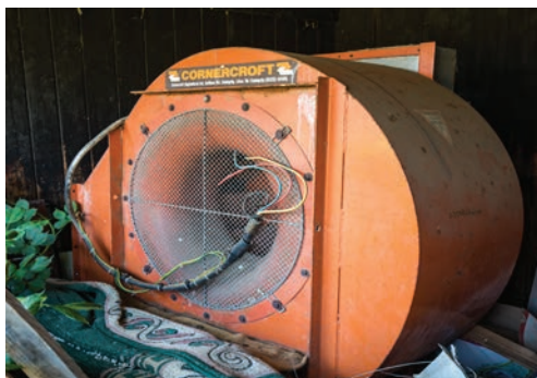
Cornercrafft TC4F Typhoon cyclone fan for drying floor, 3 phase electric, 415 volts, 30HP, s. no 19463.

Lely Any Level conventional bale elevator.