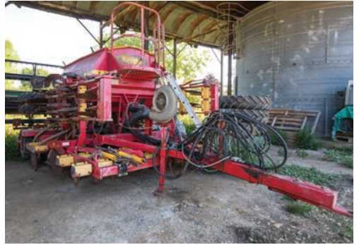
Vaderstad Rapid 400F disc drill, 4 metre, hydraulic folding, tine packer, one tonne hopper, tramline markers and trailing harrows, s. no 11189.