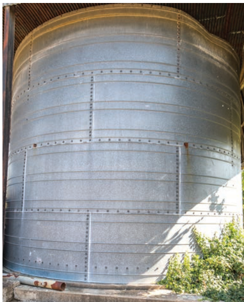
Galvanised metal cylindrical grain bin and dryer.