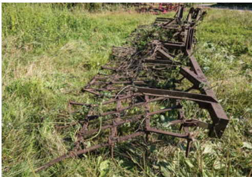
Parmiter chain harrows, 7 metre, hydraulic folding.