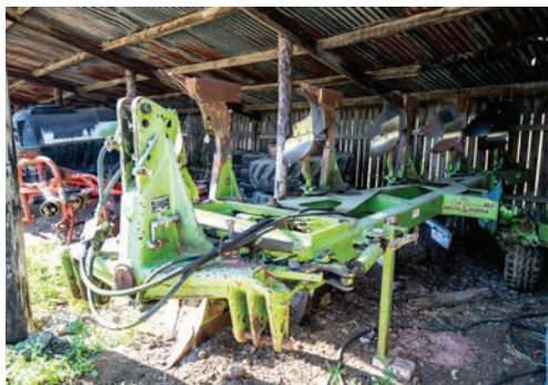
1996 Dowdeswell DP120S MA Delta Furra reversible plough, five furrow, land wheel, s no. MA36198.