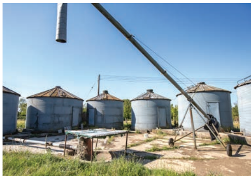
7 x Corrugated galvanised metal roofed grain bins.