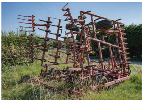
Vaderstad NZF Mark II tine harrows, 6 metre, trailed, hydraulic folding, levelling boards, tramline eradicators, s. no 13462.