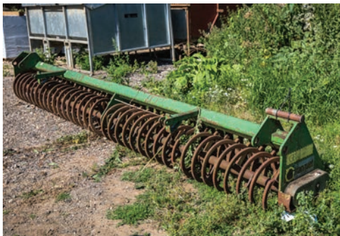
Franquet Synrchopack coil press, 4 metre s no. 4774.