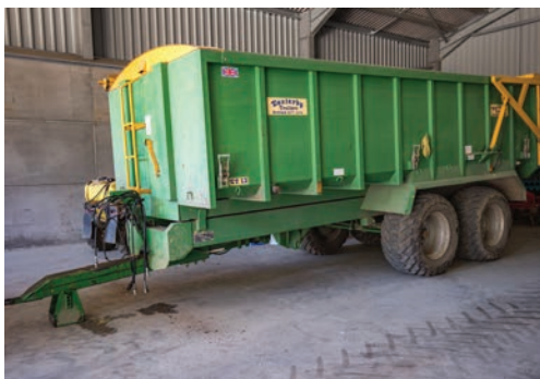
2009 Easterby ET12 grain trailer, 12 tonne, tandem axles, hydraulic brakes, suspended drawbar, leaf sprung axles, hydraulic rear door, grain chute, inspection ladder rollover sheet, Altura flotation tyres, s. no 4434.