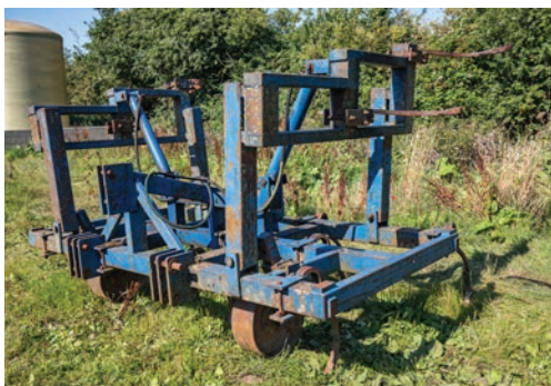
Blench pig tail tines, 4 metre, depth wheel, hydraulic folding, 3-point linkage mounted.