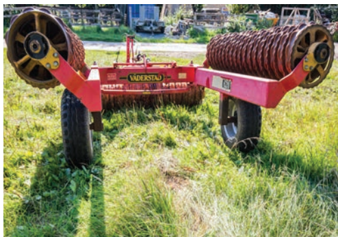
Vaderstad Rollex 620 rolls, 6.20 metre, hydraulic folding, breaker rings, s no. 8020.