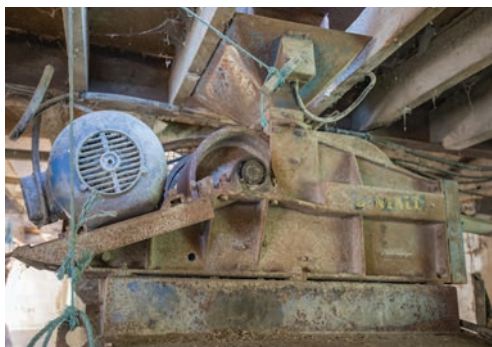
Bentall Rowlands roller grain mill, c/w roller and bagger.