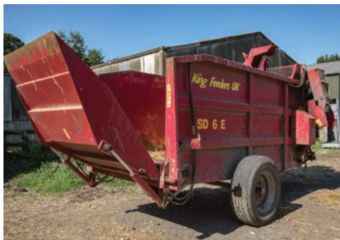
King Feeders UK SD 6 E straw chopper, PTO driven, single axle, electronic controls, hydraulic rear door.

Livestock trailer, open top, 10ft, twin axle.