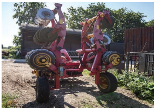
Vaderstad Carrier 425 discs, 4.25 metre, trailed, hydraulic folding, c/w Vaderstad Disc CR425 (s. no 2564), year – N, s no. carrier 0775K.