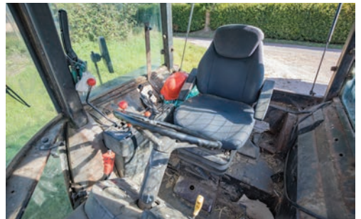
1987 John Deere 3050 , registration D592 YNP, 15,502 hours, 2WD, two manual spools, 30km/h, eight gears, splitter, pick up hitch, on farm from new, Cultor tyres 420/85R38 – 90%, BKT tyres 10.00-16 – 60%, s. no L03050T610330.

1960 Massey Ferguson 35 , registration 1944 AD, 4,294 hours, 2WD, diesel, three-point linkage, c/w loader, safety roll bar, Goodyear tyres 12.4/11-28 – 15%