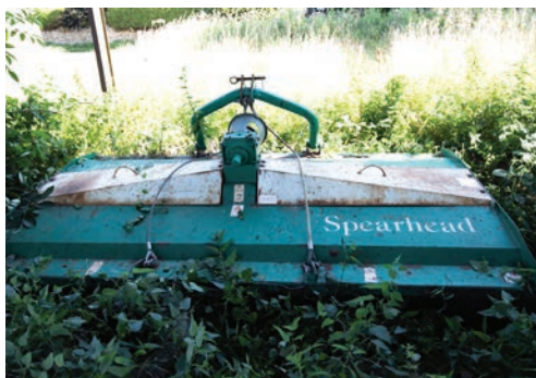
2003 Spearhead rotary topper, 3m.

Bomford Bandit 1100 flail topper, three-point linkage.