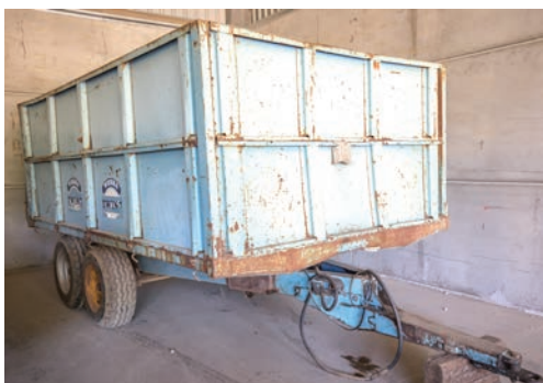
1977 Weeks Twin 7 grain trailer, 7 tonne, tandem axle, hydraulic tipping, manual rear door, grain chute, s. no 113326.