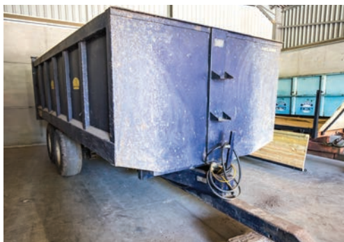
Norton grain trailer, 10 tonne, tandem axle, hydraulic tipping, leaf sprung axles, hydraulic brakes, manual rear door, grain chute, s. no 4816.