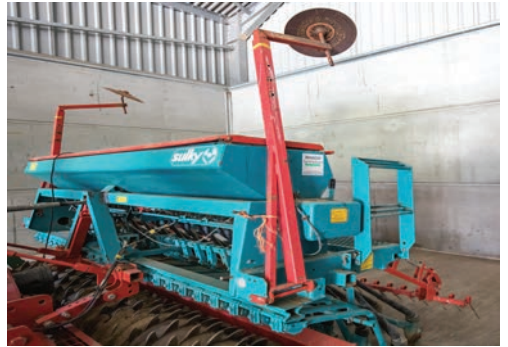
Reco Sulky Compact Master drill, 3 metre, disc markers, trailing harrows, land drive wheel, 3-point linkage mounted, hopper cover, s no. 94/cm09121.