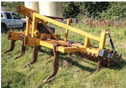
McConell Shakaerator , 7 leg, PTO driven, height adjustable rear press, 3-point linkage mounted, s. no 18CP29.