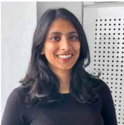
Kreeshnee Ore Summer Placement Student (Planning)