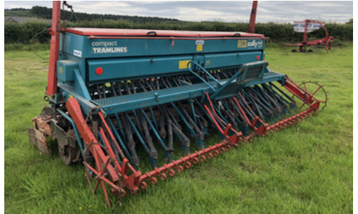
1989 Reco Sulky Compact Tramlines drill, 4m, Suffolk coulters, trailing tine harrows, disc markers, land wheel, s. no 93CT04104, stand, c/w Maschio 4000 power harrow, 4m, rear packer roller, s. no 826782.