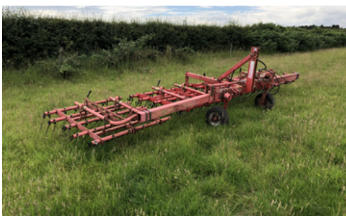
2008 Blanchi STR P600.7 tined weeder, hydraulic folding, 6m, 3-point linkage mounted, s. no 190032