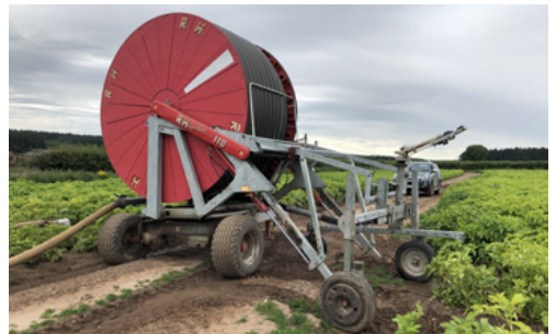
2010 RM Irrigation Super Rain 110/550 hose reel irrigator, 5,714 hours, 550m reel, 4" pipe, c/w Komet Twin 140 Plus galvanised adjustable rain gun, onboard computer, solar panel charge, hydraulic control, hydraulic turntable, machine type: 890 GX 110 550, s. no 890390.

Irrigation bar, galvanised, 3-point linkage mounted.