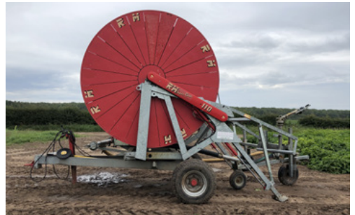
2012 RM Irrigation Super Rain 110/450 hose reel irrigator, 2,203 hours, 450m reel, 4" pipe, c/w Komet Twin 140 Plus galvanised adjustable rain gun, onboard computer, solar panel charge, hydraulic control, hydraulic turntable, machine type: 890 GX 110 450, s. no 890605.