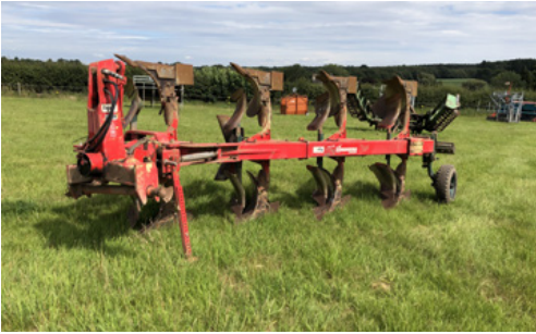
1996 Vogel and Noot Euromat Permanit 35 MS950 reversible plough, four furrow, manual variable-width, press arm, turf discs, manure skims, land wheel, s. no 033493.