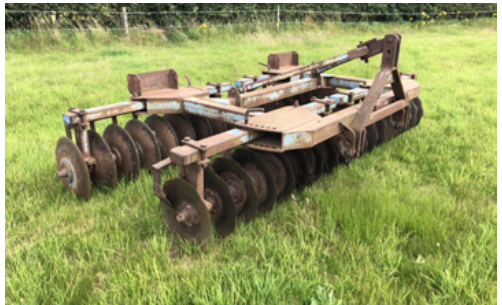
Parmiter disc harrow, 10ft, 3-point linkage mounted.

1996 Vogel and Noot plough press, 7ft, deep rings.