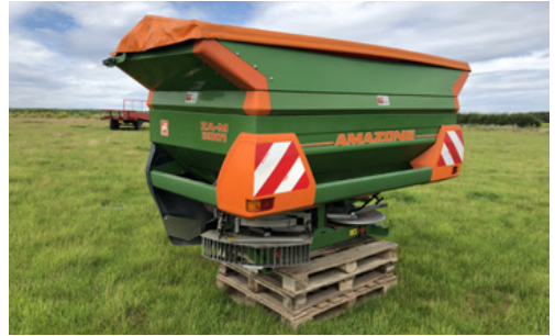
2013 Amazone ZA-M 3001 fertiliser spreader, Soft Ballistic System, 3.1 tonnes, 24/36m discs, headland shutoff, ISOBUS ready, greedy boards, hopper cover, road lights, mudguards, s. no ZAM0104388.