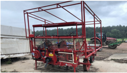
2012 Simon PLMTA leek dibber, 2m/4 rows per bed, 3-point linkage mounted, road lights, s. no 26920.