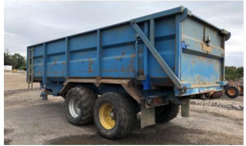
2003 Stewart root trailer, 16 tonne, 10 stud commercial tandem axles, air over hydraulic brakes, ABS, hydraulic tipping, hydraulic rear door, leaf sprung axles, sprung drawbar, inspection ladder, flotation tyres, rollover sheet, s. no 07031137.