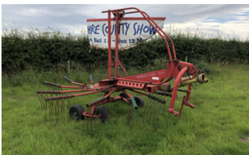
Taarup 9142 rake, single rotor, 4.2m working width, 3-point linkage mounted, s. no 7469.