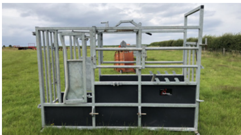
Bateman cattle crush, galvanised, 3-point linkage mounts.