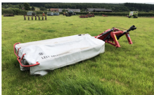
2013 Lely Splendimo 240 Classic disc mower, 2.4m, s. no 0003164039-2013.