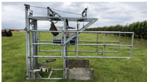
IAE dairy cattle crush, galvanised, s. no 0022462.

Rappa ATV Winder electric fencing machine, c/w stake holder, quad bike mounted.