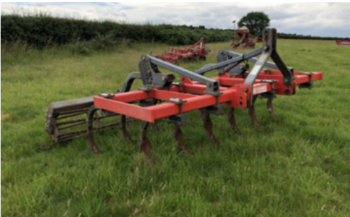
2008 Dondi BR 13R c-tine stubble cultivator, 3m, 13 legs, rear crumbler roller, s. no 0870.