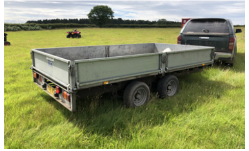
Ifor Williams LM126G flatbed trailer, 12ft, tandem axle, drop sides, ramps, lockable coupling head, s. no SCK600000B5077872.

Flatbed trailer, 14ft, single axle, homemade, no floor.