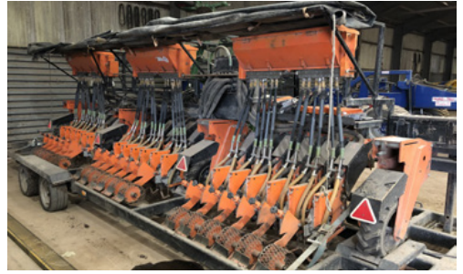
Stanhay carrot air drill, 3 x 2m beds, 12 row, 4" row, hydraulic fan, 3-point linkage mounted, c/w Vydate applicator kit, c/w canvass cover, c/w low loader transport trailer.