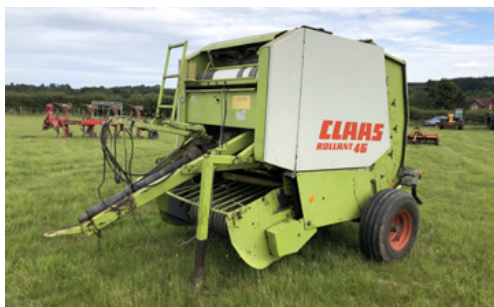
Claas Rollant 46 round baler, net and string, 4.52ft pick up reel, 540 PTO driven, electric control box, s. no 00702781HD.