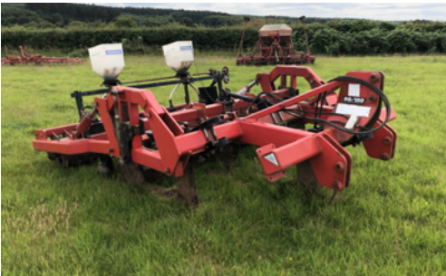
Spaldings 90/150 flat lift, 2.55m, three legs, s. no 900720, c/w Spaldings 12965 discs, s. no 2802585, c/w Spaldings 2288 hydraulic controlled rear packer roller, s. no 18213402, c/w Horstine Microband seeder.