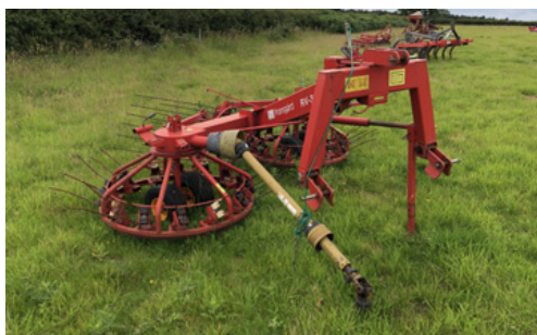
Fransguard RV-390 hay tedder, 3-point linkage mounted, s. no 40400090.