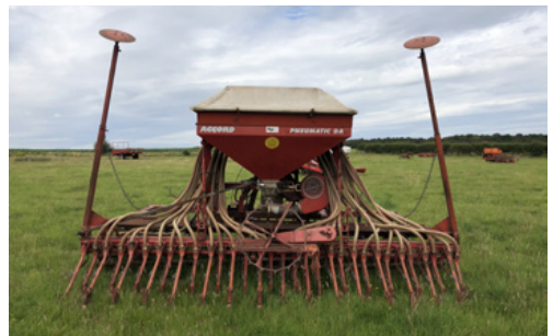
Accord Pneumatic DA air drill, 4m, Suffolk coulters, electronic tramlining, land wheels, disc markers, c/w Doublet-Record spring tines, crumbler roller, and levelling board.