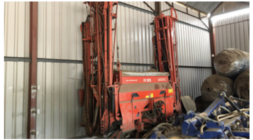
2006 Kuhn Aero 2224 boom fertiliser spreader, 24m, 1.2 tonne hopper, hydraulic pump, control box.