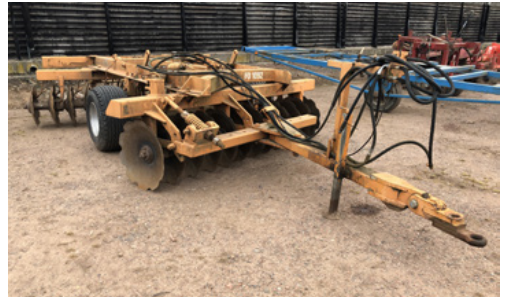
1984 Simba MK 2B discs, 3m, hydraulic lift, s. no 985.