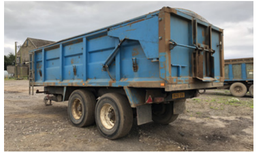
3 x AS Marston root trailer, 14 tonne, 10 stud commercial tandem axles, air over hydraulic brakes, hydraulic tipping, hydraulic rear door, leaf sprung axles, sprung drawbar, inspection ladder, super single wheels and tyres, grain chute, rollover sheet.