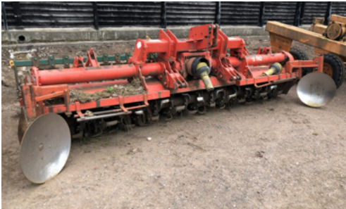
2009 Kuhn EL 201H-400 rotavator, 4m, double D press.