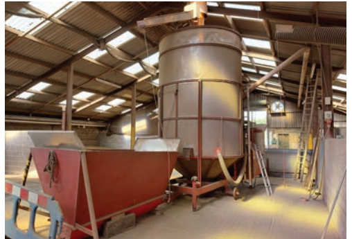
2003 Master Driers Junior 100E batch grain drier, ten tonne capacity, kerosene, electric control box, trailed, c/w hopper, s. no NE1603.

Sparex moisture meter. Farmex whole grain tester. Grain sample spear. Grain temperature probe.