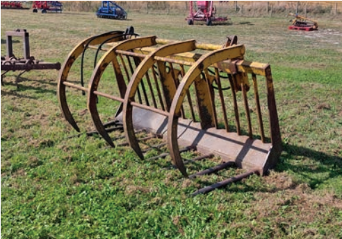
Muck grab, 2.3m, JCB toolcarrier brackets.