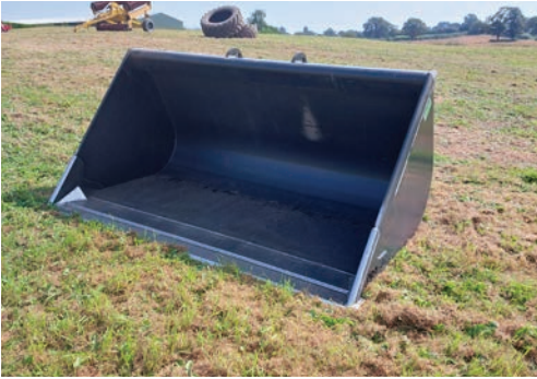
2018 Strimech Pro-Ag grain bucket, 7' 6" / 1.7m 3 , JCB toolcarrier brackets, s. no 226826.