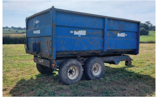
1985 AS Marston FF8L grain trailer, 8 tonne, tandem axle, hydraulic brakes, hydraulic tipping, manual rear door, grain chute, inspection ladder.