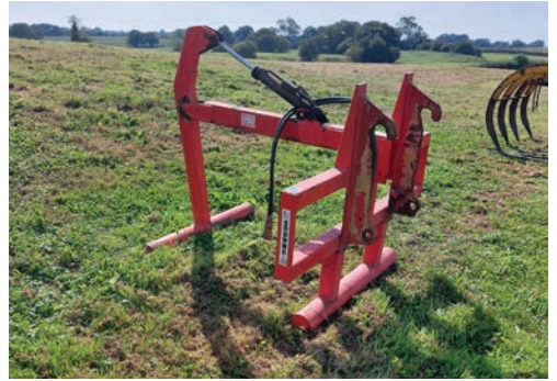
Browns big bale gripper, JCB toolcarrier brackets, s. no 44927.