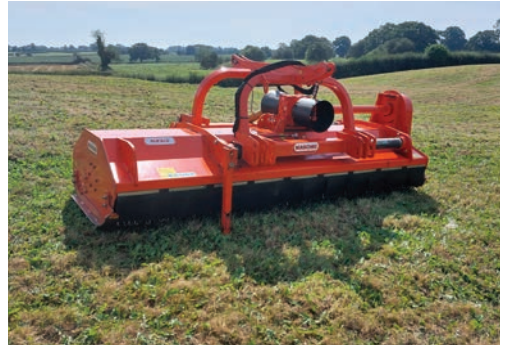
2020 Maschio Bufalo 280 heavy duty flail topper, 2.8m, front or rear 3-point linkage mounted, PTO driven, hydraulic side shift, rear roller, s. no KM91F0431.