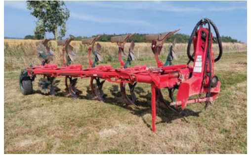
Vogel & Noot c-plus XS950 ST Vario reversible plough, five furrow, rear discs, skims, land wheel, type: C59C565A79, s. no 79265.