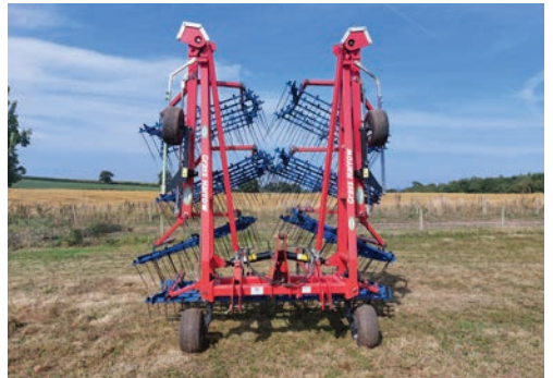
2016 Opico Grass Harrow , 12m, 7mm tines, hydraulic folding, scissor folding, 3-point linkage mounted, s. no 0188/16.