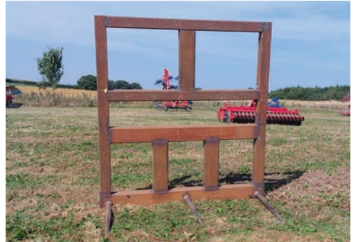
Homemade bale spike, 1.7m, 3 x tines, JCB toolcarrier brackets.