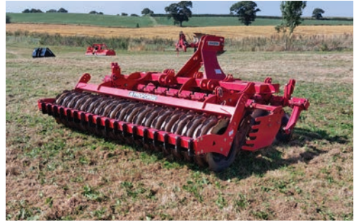
Proforge Inverta short disc harrow cultivator, 3m, 3-point linkage mounted, 22in cut away discs, steel packer, s. no 2961.