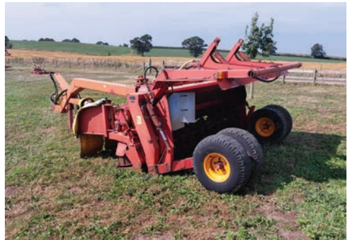
Taarup 338 B mower conditioner, 3m, hydraulic offset, trailed PTO driven, s. no 333771.

Flat roll, 2.4m, concrete filled, trailed.