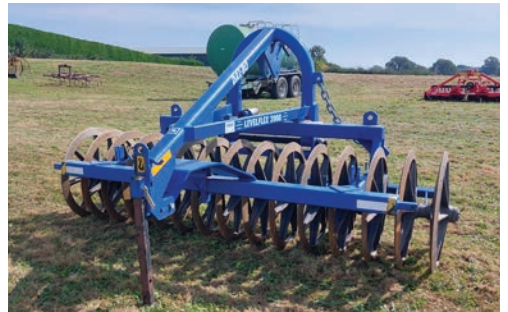
2011 Dalbo Levelflex 2008 front press, 3m, 3-point linkage mounted, c/w stand, s. no 02608.