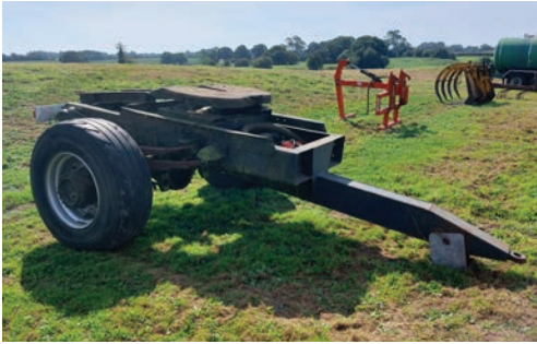
Fifth wheel dolly, leaf sprung.