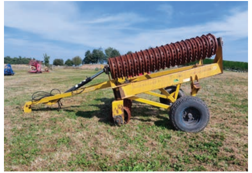
1999 Twose U-HF/21/CB3 cambridge rolls, 6.3m, breaker rings, hydraulic folding, trailed, s. no 897277.

Cambridge rolls, triple gang, 1 x 2.4m, 2 x 1.6m, trailed. Pig tail cultivator, 3m, 3-point linkage mounted.